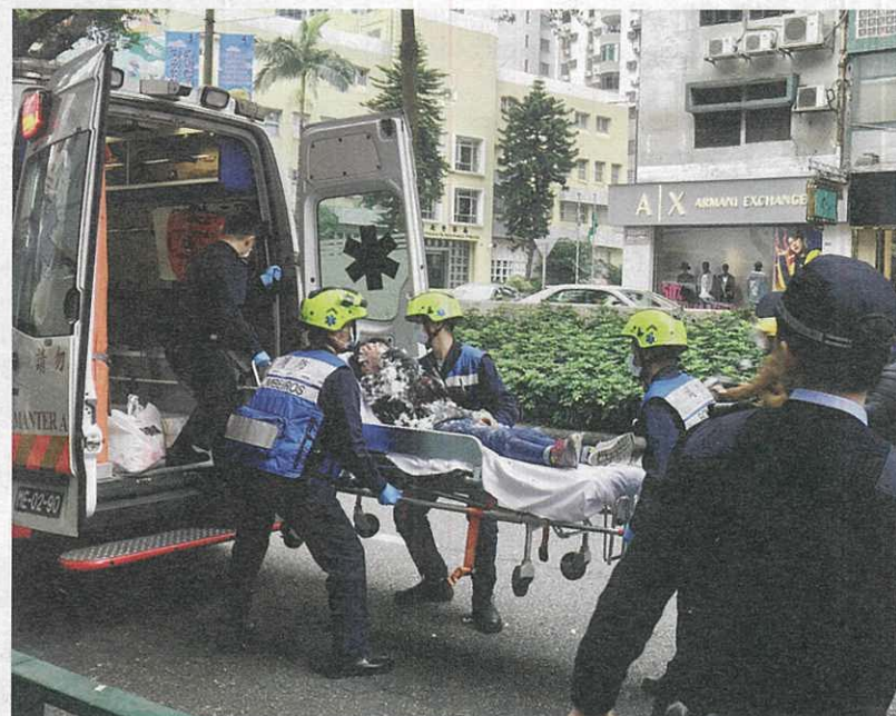
Police officers move the injured woman on a guerny into an ambulance for treatment at the public Conde de S. Januário Hospital Centre.

When the police arrived at the scene, the woman was conscious and told the police that she knew the perpetrator who had fled after