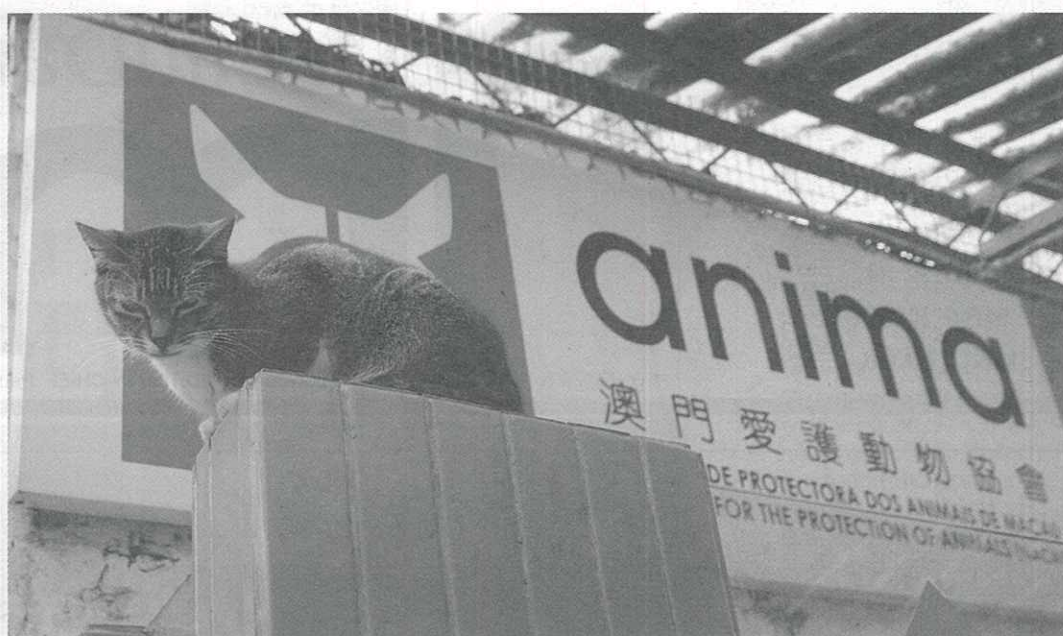
A cat at the association's facilities